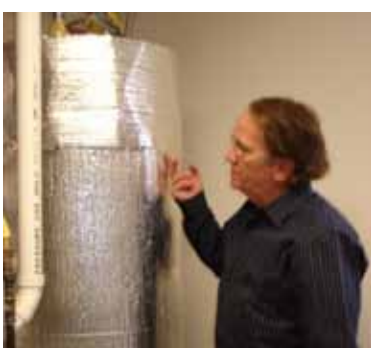
Water Heater Cover

"As grandparents we have no greater blessing than our two granddaughters," said the Browns.