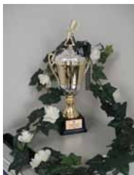
Winners Trophy Awarded at Annual Meeting

SCI REMC Ranked First in the State for Responses