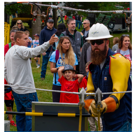
Each year, SCI REMC employees volunteer their time at Peden Farms, with lineworkers also presenting a live-line safety demonstration for the children.