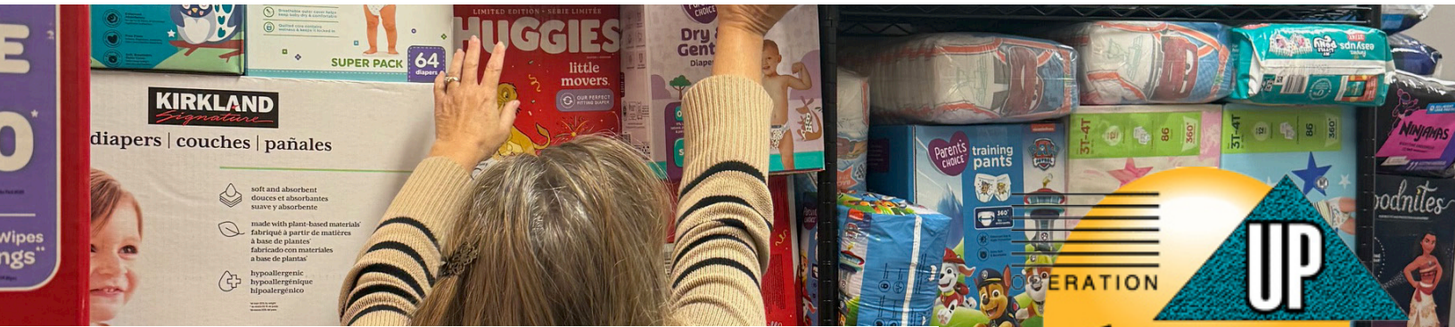
Photo provided by Clarity of Central Indiana, a grant recipient of SCI REMC's Operation RoundUp program.